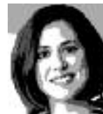
FAVORITE BUILDING IN THE WEST

One Architects 970-728-8877, onearchitects.com P.O. Box 3442 Telluride, CO 81435