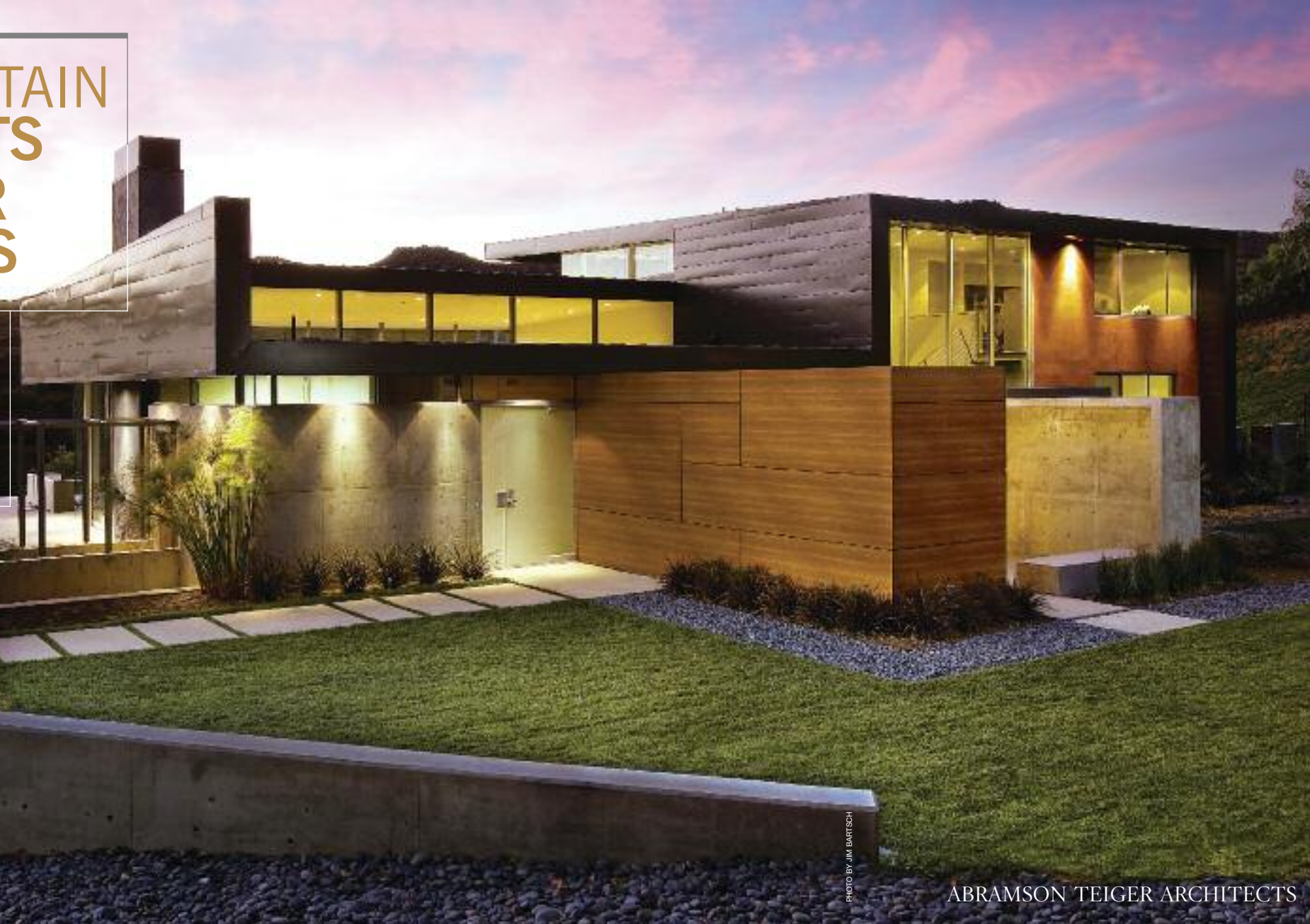
ABRAMSON TEIGER ARCHITECTS

The editors of Mountain Living are pleased to present the 2012 edition of Top Mountain Architects & Interior Designers, your exclusive guide to the most talented and influential architects, design/build professionals and interior designers at work in the West today