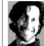
FAVORITE BUILDING IN THE WEST