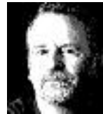
FAVORITE BUILDING IN THE WEST

David Johnston Architects 970-925-3444, djarchitects.com 418 E. Cooper Street, Suite 206 Aspen, CO 81611 DGBK Architects 604-682-1664, dgbk.com 1500 W. Georgia Street, Suite 950 Vancouver, British Columbia V6G 2Z6 DHR Architecture 303-355-2460, dhrarchitecture.com 3200 Cherry Creek South Drive, Suite 410 Denver, CO 80209 Douglas Miller DeChant Architects/Shepherd Resources 970-949-3302, sriarchitect.com 37347 U.S. Highway 6, Suite 102 Avon, CO 81620 Dubbe-Moulder Architects 307-733-9551, dubbe-moulder.com 1160 Alpine Lane, Suite 2A Jackson Hole, WY 83002 Earl Anderson & Associates 720-529-8828, earlanderson.com 99 Inverness Drive East, Suite 250B Englewood, CO 80112 Eggers Architecture 970-724-3411, eggersarchitecture.com P.O. Box 798 Kremmling, CO 80459 Ellis Nunn & Associates 307-733-1779, ellisnunnarchitects.com 70 N. Center Street Jackson, WY 83002 Eric Hedlund Design 208-755-2488, eh-design.net P.O. Box 3741 Coeur d'Alene, ID 83816 Ewing Architects 626-584-0860, ewingarchitects.com 723 E. California Blvd. Pasadena, CA 91106 Faulkner Architects 530-582-7400, faulknerarchitects.com 12242 Business Park Drive, Suite 18 Truckee, CA 96161 Faure Halvorsen Architects 406-587-1204, faurehalvorsen.com 1425 W. Main Street, Suite A Bozeman, MT 59715 Feather & Gill Architects 505-471-2195, featherandgill.com 418 Cerrillos Road, Suite 24 Santa Fe, NM 87501 Finholm Architects 970-925-5713, finholmarchitects.com P.O. Box 5546 Snowmass Village, CO 81615