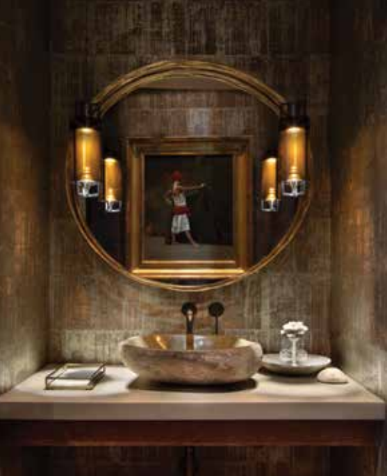
The powder room features a custom vanity made by Elements Concrete in Bozeman, Montana, the stone sink is from Stone Forest, and the wall covering is from Innovations.