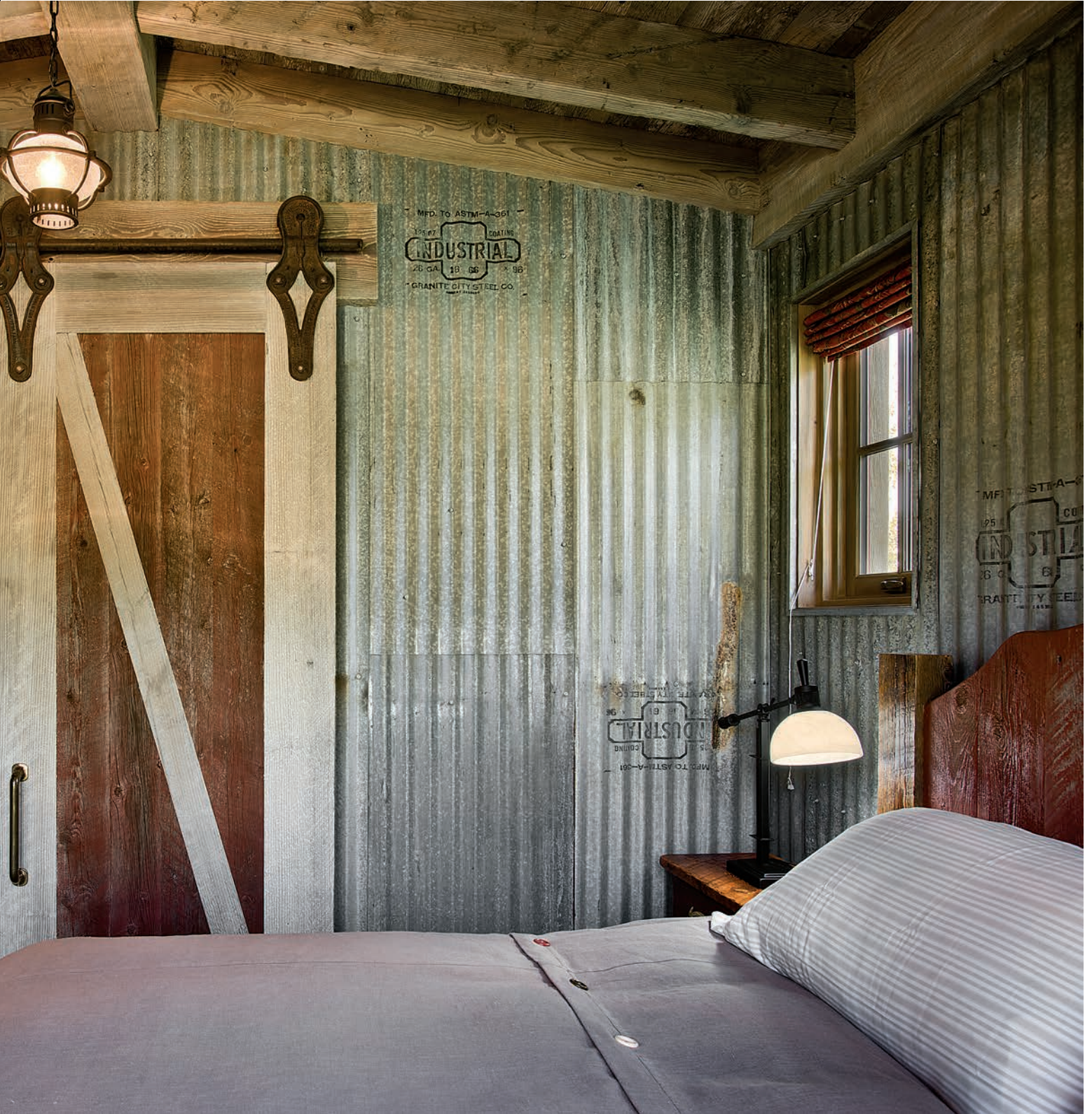
SALVAGED BARN WOOD REPURPOSED INTO CABINETS AND DRY BRUSHED A VINTAGE RED GIVE AN OLD WEST AMBIANCE TO A BEDROOM. SLIDING BARN DOORS MADE OF METAL—COMPLETE WITH AUTHENTIC HARDWARE—ALONG WITH A TROUGH STYLE BASIN IN THE ADJACENT WASHROOM COMPLETE THE LOOK OF YESTERYEAR.