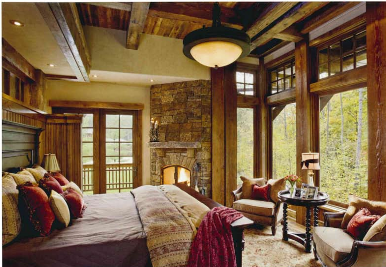
ABOVE: A strong outdoors connection is also felt in the bedroom of the master suite. Chair and coverlet fabrics, Ralph Lauren Home. Pillow and duvet fabrics, Robert Allen. Habersham bed. Bernhardt chairs. BELOW: The deck is an extension of the master suite. That side of the house accommodates the site's slope, revealing the floor plan's lower level, where there's an exercise room, a squash court and a theater. OPPOSITE: The library's nook.

up from there," she says. The earth tones and relatively simple patterns the clients favored set the tone for the rest of the house.