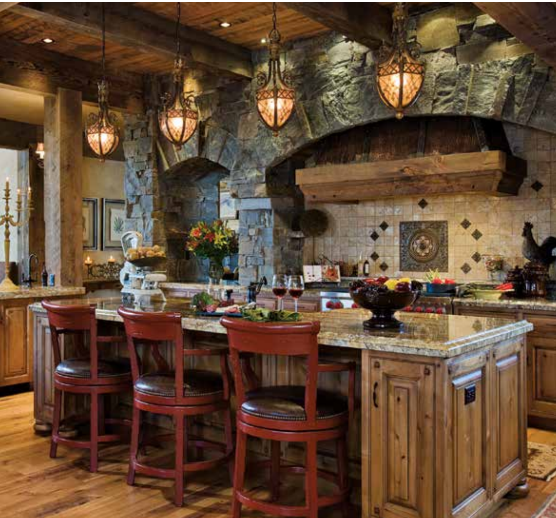
From left: The covered deck in this Yellowstone Club home can be enjoyed all year, thanks to a cozy fireplace and space heaters for chilly evenings. Chairs are made of natural peeled logs and covered with cushions with weather-resistant fabrics; the chandelier is by Fire Mountain Forge. | A quartet of pendant lights by Fine Art lamps illuminates the granite-topped work island in this mountain kitchen, where custom red leather-cushioned stools provide casual seating. The wine refrigerator is SubZero.

homes. She has a great eye for design, color and furnishings, and she's an excellent communicator who pays attention to the details. I especially love the master bedroom she created in our Montana home; it's a true retreat with a cozy stone fireplace and windows framed by beautiful drapes that look out on a gorgeous view."