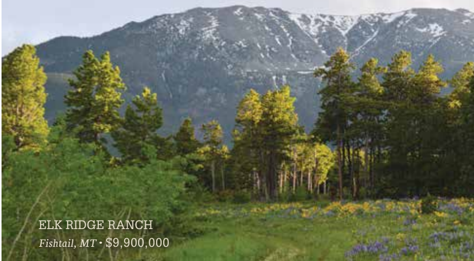
ELK RIDGE RANCH Fishtail, MT • $9,900,000