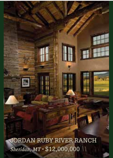
JORDAN RUBY RIVER RANCH Sheridan, MT • $12,000,000