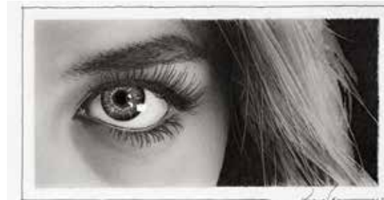
At a Glance